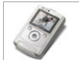
COOLWALKER MSV-01 digital photo storage viewer