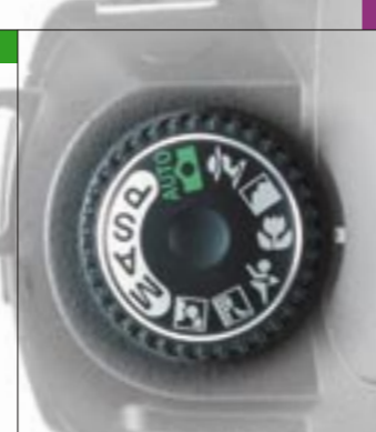
User-friendly controls include the Mode dial for direct access to the new Digital Vari-Program selections