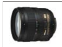
AF-S DX Zoom-Nikkor 18-70mm f/3.5-4.5G IF-ED